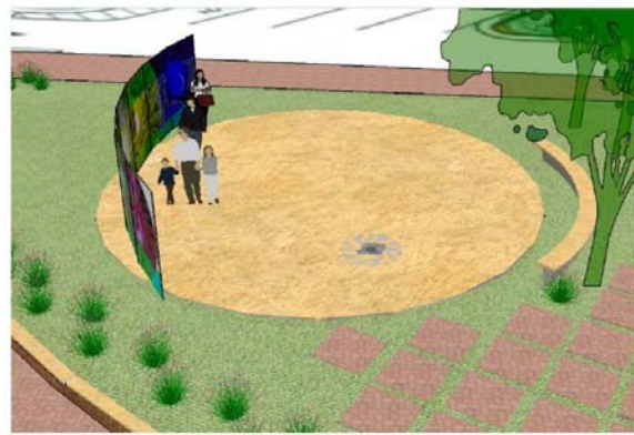
Gathering area & park around wall at tip of College St. parking lot

After reviewing the project's history, the City Manager proposed several questions for City Council to consider in order to provide city staff with guidance before the project continues. He asked City Council to consider the proposed location of the art, its support of the incorporation of this project into Phase III of the Downtown Revitalization project, its support of the Public Art Committee's efforts to raise the majority of the funds necessary to fund the project, and its level of financial support to this project. The City Council approved a motion to support the Arts Council's efforts to pursue grant funding, accepted the rest as information, and agreed to revisit the issue at a later date.