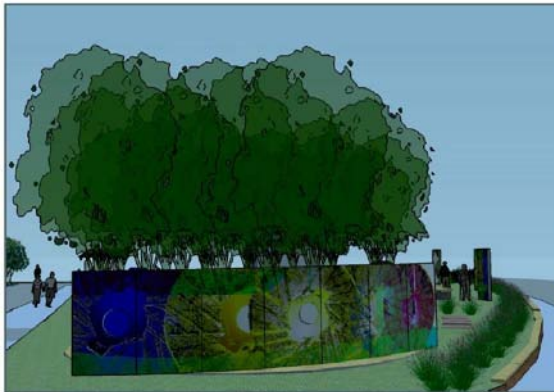
View of wall from Main St.