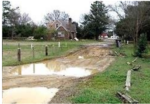
Abron Street before paving (2012)