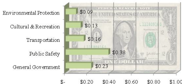
Amount of Dollar Used per General Fund Function for Proposed FY09-10 Budget

establishes what the city can spend for the fiscal year. To make changes to the budget throughout the year, City Council must approve budget amendments. Once adopted, the budget becomes even more important. It is a guide to direct department activities and services, a management tool to improve services, and a communication tool for citizens to see how their tax money provides services. You can view the entire city budget online under the documents link, the Finance Department's page, or the City Manager's page.